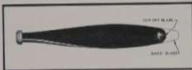
Figure 1-12. Blade Cut-Off Diagram