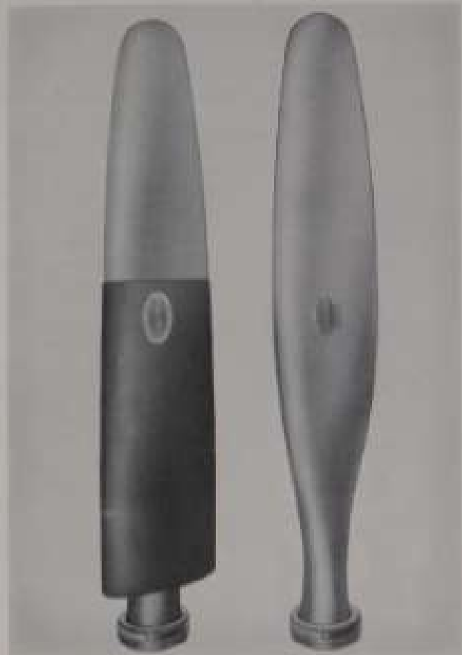
Figure 1-13. Blade With and Without Fairing

1-44. The letter "A" which follows the basic blade design number group shows that the blade is a blade assembly; an assembly, which may vary slightly among the different size blades, usually includes the blade proper, the thrust bearing beveled washer, flat washer, and retainer assembly, the chafing ring, the balancing plug assembly, the bushing, the bushing screws, and the bushing drive pins.